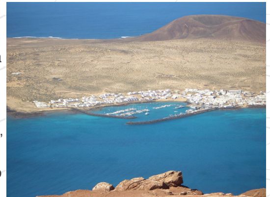
Graciosa with the harbour of Caleta del Sabo in the foreground.